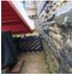
New Gate and cleaned up area.

Two new gates have been fitted to separate different areas made from recycled fence timber where the new shelter was fitted on platform 2, tidying up a working area.