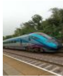
TransPennine Express rushing through.

At last, we managed to re arrange our history boards on Platform 1 to show a copy of the 1969/ 70 train timetable collected from the old station ticket office the day the old station closed for good. Interesting to see the timetable ran up to May 1970 but the station closed in January of that year.